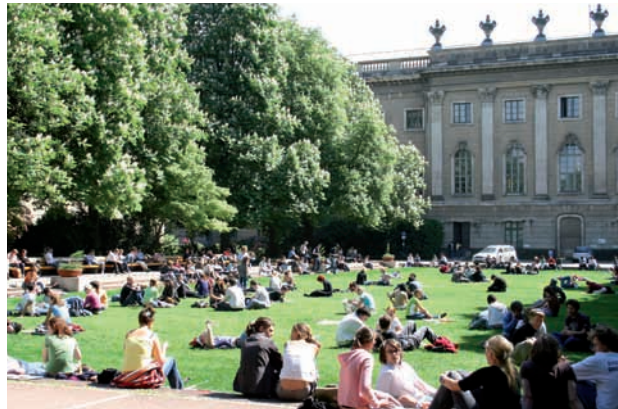
Students at Humboldt-Universität zu Berlin