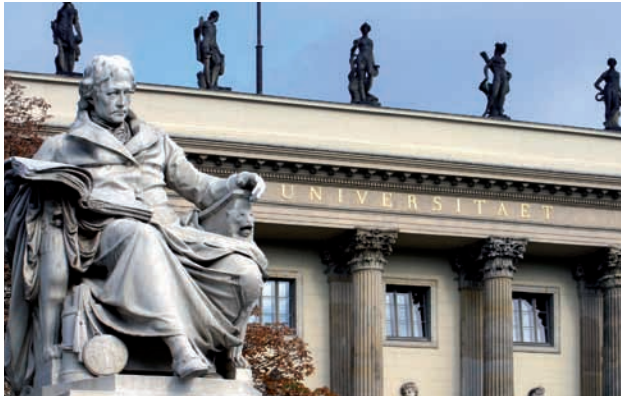
Humboldt-Universität zu Berlin