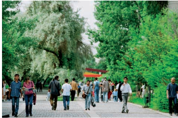
Students at METU, Ankara